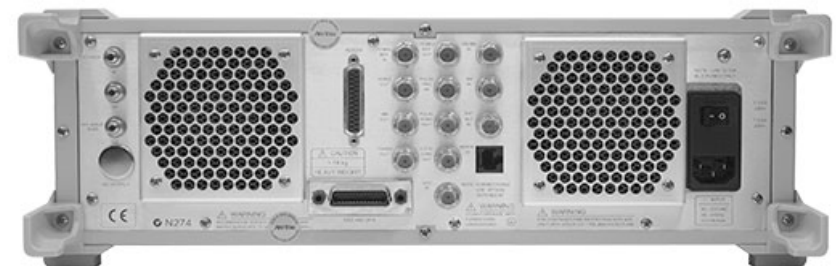
RF/Microwave/Millimeter Signal Generator MG3690C